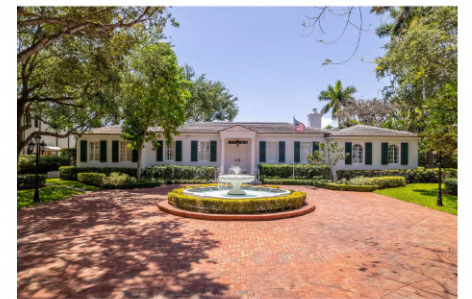
There are only 60 homes on all of La Gorce Island.