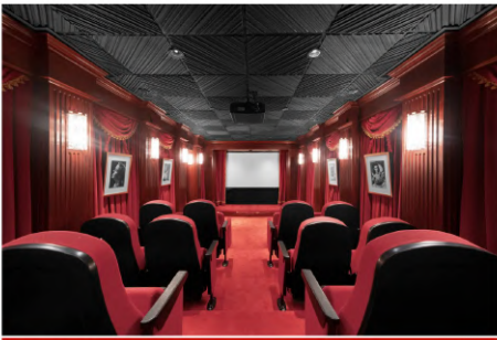
The estate includes a theater.

The new listing includes a 5,000-bottle wine storage area, a theater and a conference center.