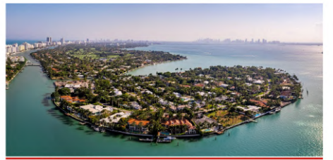
The property has 600 feet of water frontage.

She also noted that the property boasts 600 feet of water frontage that can host a yacht.