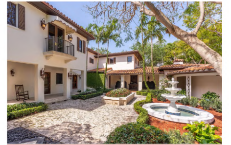
The property has a 5,000-bottle wine storage area.

Proceeds from what is expected to be a mammoth final sale will go to Pearce's foundation and its support of medical research and the arts, according to The Journal.