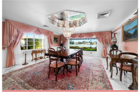
The property is the most expensive listing in Florida real estate history.