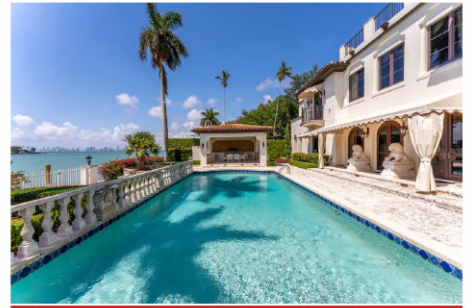
Proceeds from the final sale will go to medical research and the arts. The Jills Zedler Group/1 Oak Studios