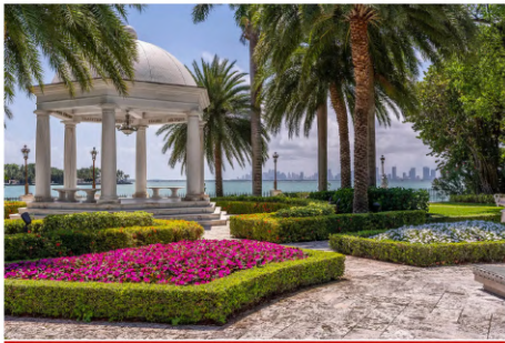
A private park with a marble gazebo is considered the "crown jewel" of the property.

Pearce, who lived on the estate for several decades, later purchased additional contiguous parcels to create the luxurious expanse that exists today.