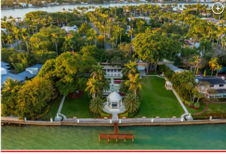
A compound on Florida's La Gorce Island is on the market for $170 million — the highest price ever for a listing in the Sunshine State.

A spectacular Miami Beach compound is hitting the market for $170 million, the highest price ever sought in the storied history of Florida real estate.