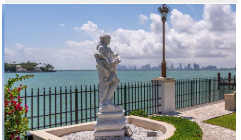
JILL ZEDER GROUP/DAK STUDIOS