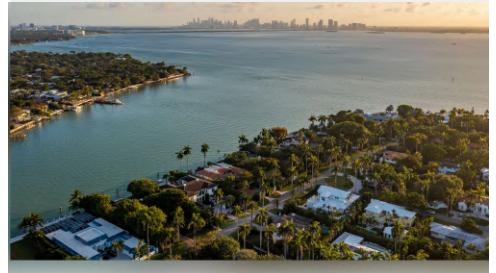
The compound has a private dock, with its own dock and a marble gazebo.