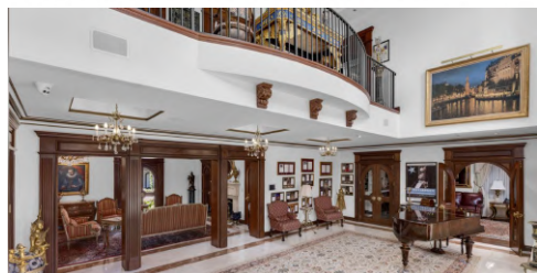
The estate has three homes plus a guest house.

Home prices in the Miami area, much like the rest of the country , are soaring. During the first quarter of 2022, the median sales price for a single-family home in Miami Beach rose nearly 19% year-over-year, according to real-estate appraisal firm Miller Samuel.