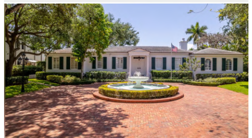
A two-bedroom house with a circular driveway and fountain. A garage was converted into a wine storage area.