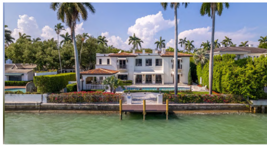
A waterfront compound on La Gorce Island in Miami Beach is asking $170 million.

BY A.A. SOLOMON | ORIGINALLY PUBLISHED ON MAY 4, 2022 | THE WALL STREET JOURNAL