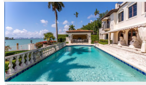
A pool with views of Biscayne Bay and downtown Miami.