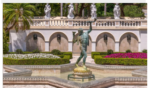
JILL ZEDER GROUP/DAK STUDIOS