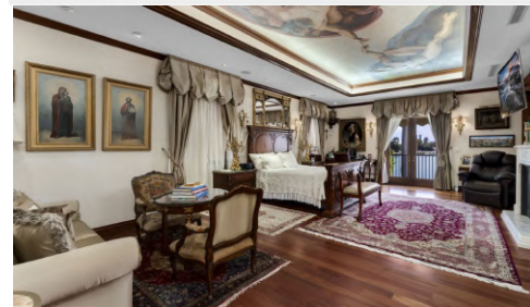
The largest home is around 8,700 square feet with five bedrooms.