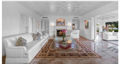
He used one of the homes for entertaining and staff.